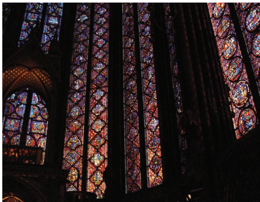
Figure 1 | The magnificent glass window of La Sainte Chapelle in Paris. The window's deep yellow and red colours (bottom) — seen on exposure to oblique sunlight — are probably caused by the scattering of light from silver, gold and copper nanoparticles.

If the size of plasmonic nanoparticles — those composed of highly conducting metals — approaches or exceeds several tens of nanometres, they scatter light strongly. This is a beautiful phenomenon, and can be witnessed when sunlight obliquely strikes glass windows in churches and cathedrals (Fig. 1) — presumably, these contain gold, silver and copper nanoparticles. However, such light scattering causes broadening and dulling of the nanoplasmonic resonances, making them less significant in fundamental science and less suitable for applications. It would therefore be useful to use smaller nanoparticles, which do not suffer from such a drawback. But it is difficult to fabricate, assemble and tune them to specifications.