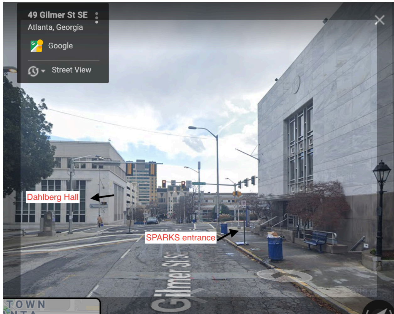
View of Sparks hall and Dahlberg hall from Gilmer Street