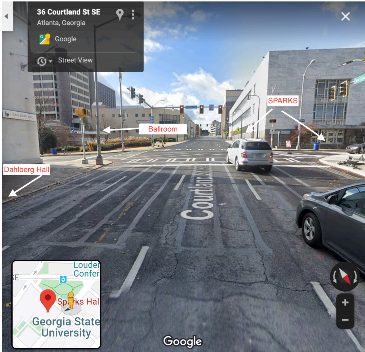
View from Cortland street Sparks entrance, Dahlberg hall, and Student center ballroom